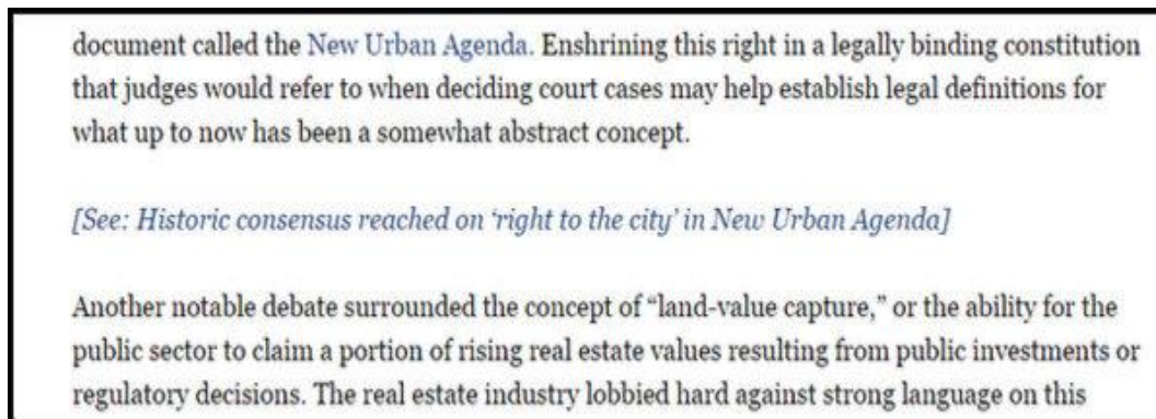
Example of an interstitial link