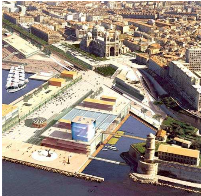
Marseille - Euromed

It is a main issue for the city branding, for the enhancement of the city image and, so far, developing leisure and tourism is the scope for all the cities to become attractive to investors and newcomers. A port-city has usually been the engine of its region. It has created its identity, its character, its history. It is very much of an emblem and its notoriety is usually important (see Rotterdam, Genova...). The urban centrality is, therefore, being rediscovered.