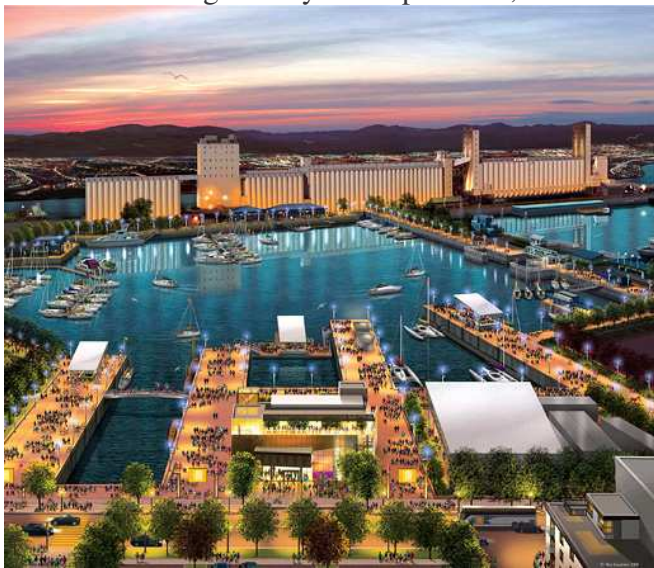
Quebec – 400 th anniversary space