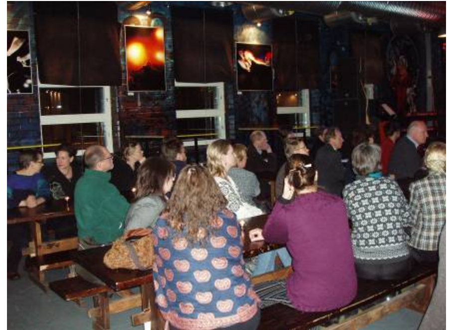
New format for stakeholders participation: Local support group