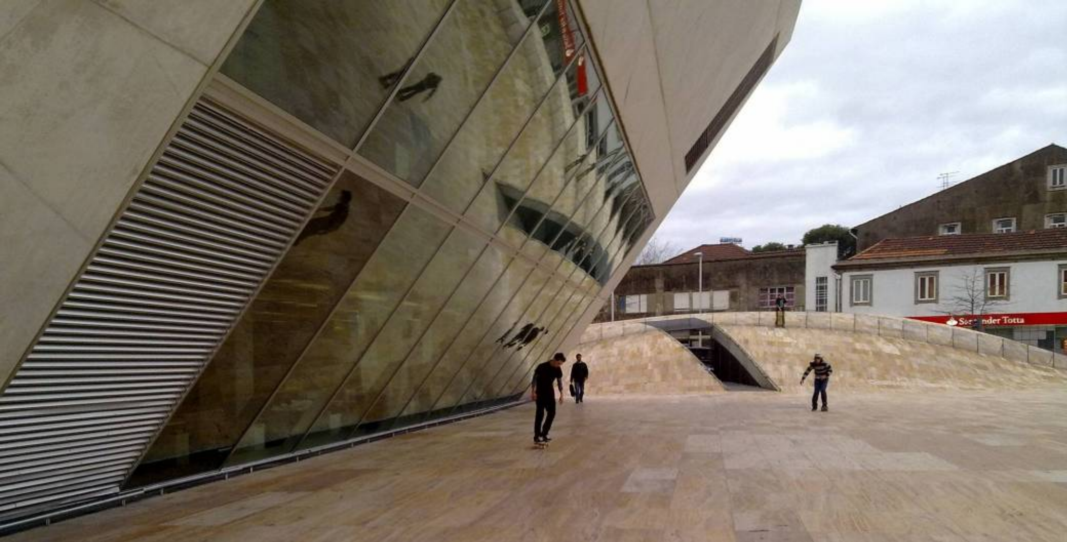
Casa da Musica_Porto_Portugal