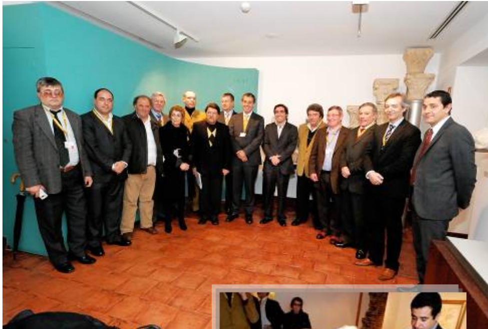
Involvement and commitment of Mayors and elected people