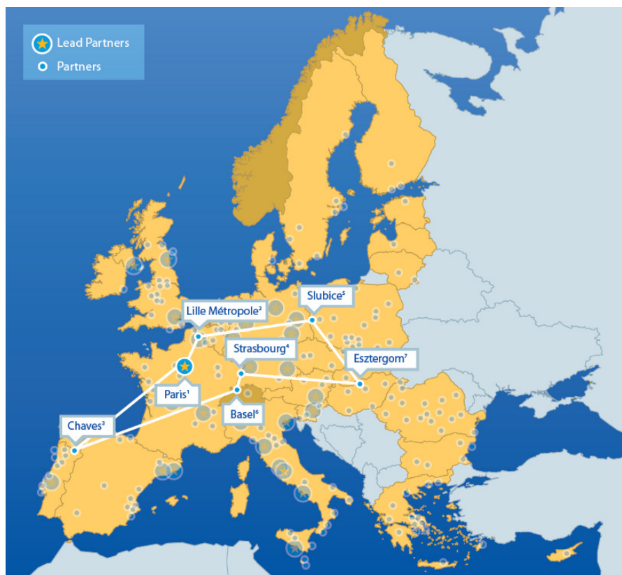
1. Paris - MOT • 2. Eurometropole Lille-Kortrijk-Tournai • 3. Eurocidade Chaves-Verin 4. Eurodistrict Strasbourg-Ortenau • 5. Frankfurt (Oder)/Slubice conurbation 6. Trinationaler Eurodistrict Basel • 7. Ister-Granum EGTC

The project is led by Mission Opérationnelle Transfrontalière (MOT); it involves six cross-border conurbations in Europe: Lille Métropole for the Eurometropole Lille-Kortrijk-Tournai (F/BE), Basel for the Trinational Eurodistrict Basel (F/DE/CH), Esztergom for the Ister-Granum EGTC (HU/SK), Chaves for the conurbation Chaves-Verin (ES/PT), Slubice for the Frankfurt (Oder)-Slubice conurbation (DE/PL), and Strasbourg for the Eurodistrict Strasbourg-Ortenau (F/DE).