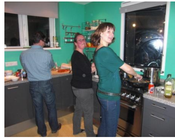
My Generation dinner at Cleo's