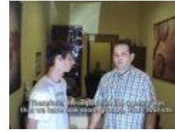
My Generation: Tirgu-Mures case study

Movie about the "Open Door Week in companies in Latvia", of prepared by young people from Riga, Latvia