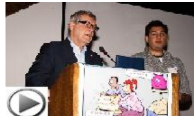
2) My Generation final conference Friday 1 April 2011