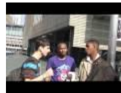
My Generation - Choices in Life