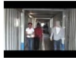
My Generation - Gangster Love