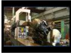
Riga case study - Open Door Week in Latvia.avi

Movie about the "Open Door Week in companies in Latvia", of prepared by young people from Riga, Latvia