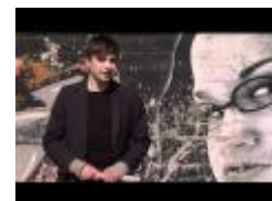
In less the 5 min.: Gdansk - participation workshop (May 2010)

Prepared by young people, to be showed at the start of the My Generation workshop in Riga (Jan 2010)