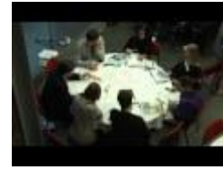
Get to know... The Rotterdam case