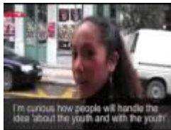
Impression of My Generation workshop in Patras (Jan 2009)

A video report prepared by the youth representatives of the Rotterdam delegation.