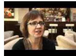
Get to know... The Göteborg case