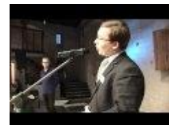
Impression of My Generation workshop in Riga (Jan 2010)

Prepared by Young People from Goteborg, to be shown at the start of the My Generation workshop in Goteborg.