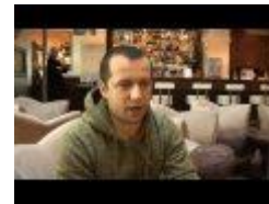
Get to know... The Warsaw case