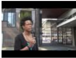
My Generation - When we were young