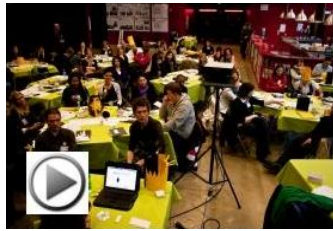
1) My Generation final workshop Thursday 31 March 2011

Invitation; Conference handout; Minutes day 1 ; Minutes day 2.