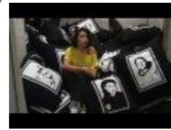
My Generation in Rotterdam: EUROPEAN YOUTH CAPITAL 2009

40 youngsters from 11 European cities gathered in Rotterdam My Generation Youth Exchange. Filmed by Glashard Productions.