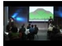
Get to know... - The Riga case