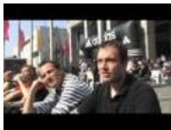
My Generation - Rotterdam Makeover