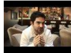
Get to know...The Patras case