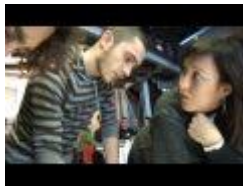
Get to know... The Valencia case