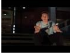
My Generation youth exchange - promo - A week @ Rotterdam (April 2009)