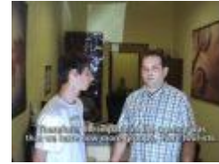
My Generation: Tirgu-Mures case study

Movie about the "Open Door Week in companies in Latvia", of prepared by young people from Riga, Latvia