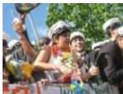
Watch Goteborg in pictures

Prepared by Young People from Goteborg, to be shown at the start of the My Generation workshop in Goteborg.