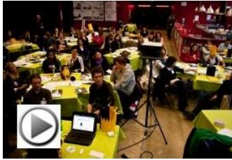
1) My Generation final workshop Thursday 31 March 2011

Invitation; Conference handout; Minutes day 1 ; Minutes day 2.