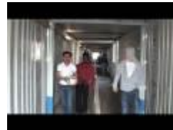
My Generation - Gangster Love