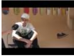
My Generation - How does Rotterdam....

Video's made by groups of participants of the Rotterdam youth exchange