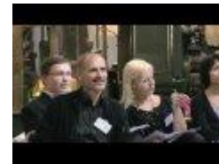
Impression of MyGeneration Workshop in Goteborg, Sweden (Sept 2009)

A video report prepared by the youth representatives of the Rotterdam delegation.