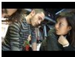
Get to know... The Valencia case