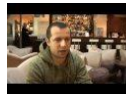
Get to know... The Warsaw case