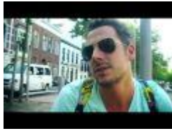
My Generation : An example movie

Instructions for the young people in the My Generation partner cities.