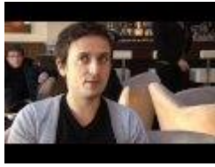
Get to know... the Gdansk case