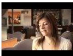
Get to know... The Birmingham case