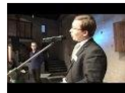
Impression of My Generation workshop in Riga (Jan 2010)

Prepared by Young People from Goteborg, to be shown at the start of the My Generation workshop in Goteborg.