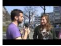
My Generation - Streetwise