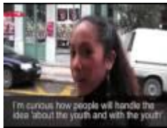
Impression of My Generation workshop in Patras (Jan 2009)

A video report prepared by the youth representatives of the Rotterdam delegation.