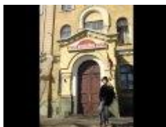
Slideshow of Riga

Prepared by young people, to be showed at the start of the My Generation workshop in Riga (Jan 2010)