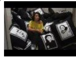
My Generation in Rotterdam: EUROPEAN YOUTH CAPITAL 2009

40 youngsters from 11 European cities gathered in Rotterdam My Generation Youth Exchange. Filmed by Glashard Productions.