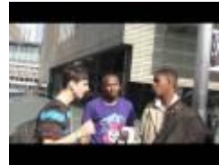
My Generation - Choices in Life