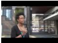
My Generation - When we were young