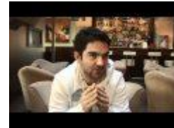
Get to know...The Patras case