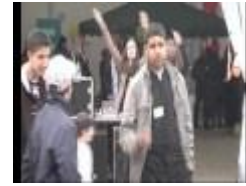
Youth competence centers Antwerp (a video impression of the written case study description)

Instructions for the young people in the My Generation partner cities.