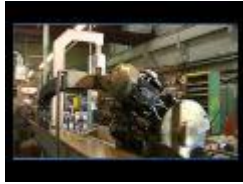
Riga case study - Open Door Week in Latvia.avi

Movie about the "Open Door Week in companies in Latvia", of prepared by young people from Riga, Latvia