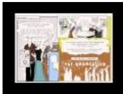
The My Generation Story