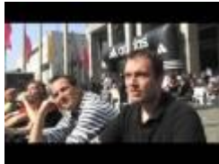
My Generation - Rotterdam Makeover