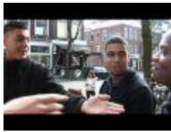
Impression My Generation youth Exchange PART 2 long version (April 2009)

40 youngsters from 11 European cities gathered in Rotterdam My Generation Youth Exchange. Filmed by Glashard Productions.