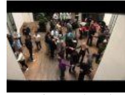
Impression My generation youth exchange PART 1 long version (April 2009) 40 youngsters from 11 European cities gathered in Rotterdam My Generation Youth Exchange.