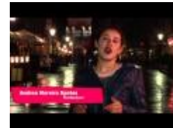
Get to know... My Generation