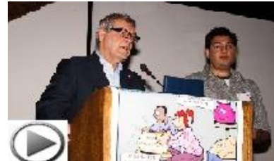
2) My Generation final conference Friday 1 April 2011