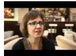
Get to know... The Göteborg case