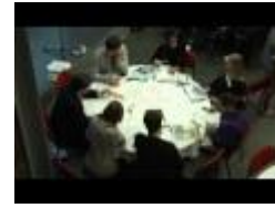
Get to know... The Rotterdam case