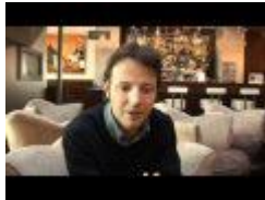
Get to know... The Antwerp case