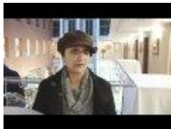
Get to know...The Glasgow case