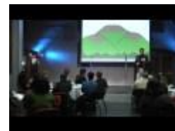
Get to know... - The Riga case