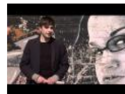
In less the 5 min.: Gdansk - participation workshop (May 2010)

Prepared by young people, to be showed at the start of the My Generation workshop in Riga (Jan 2010)