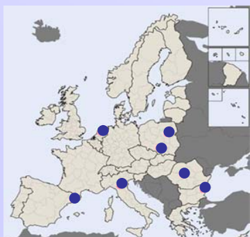
Localisation of the 7 partners