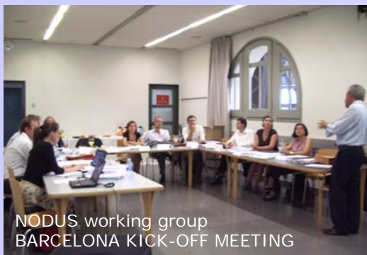
NODUS working group BARCELONA KICK-OFF MEETING