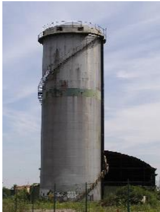
Torre dei Modelli

Furthermore, factories were usually built around three main elements: the production plants, the office buildings, and what I use to call accessory buildings . These accessory buildings are elements necessary for particular productions, often poor from an architectural point of view but essential to manufacture goods. In Sesto there are still some examples, important for local identity as landmarks and in memory of the industrial past, such as for example the "Carroponete", the "Siluro" and the "Torre dei Modelli".