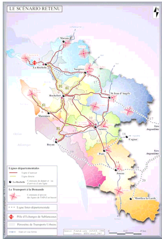
New organisation, in place since 2008

The department of Charente-Maritime is in charge of the organisation of local public transport. It has several contracts with private transport companies and since 2008 manage the organisation of transportation.