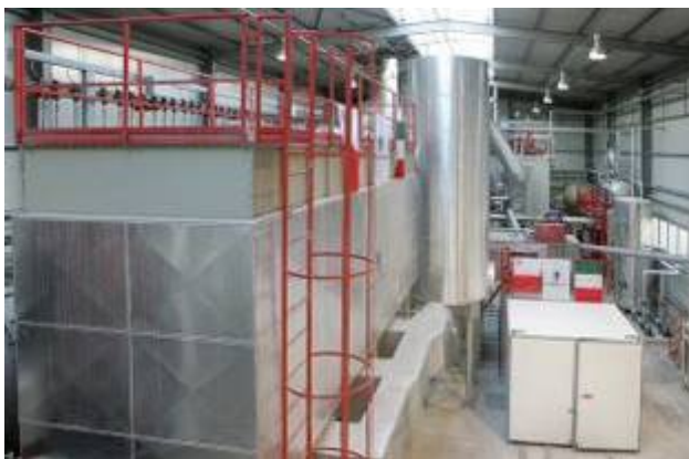
Marsa Thermal Treatment Facility