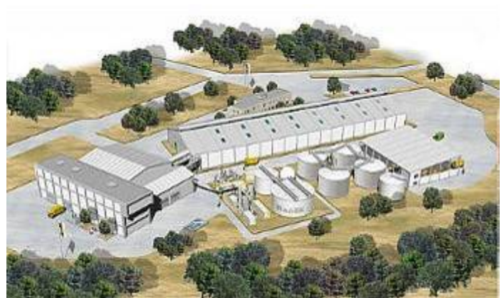
Sant' Antnin Waste Treatment Plant