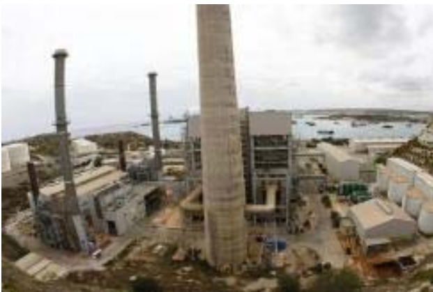
Delimara Power Station