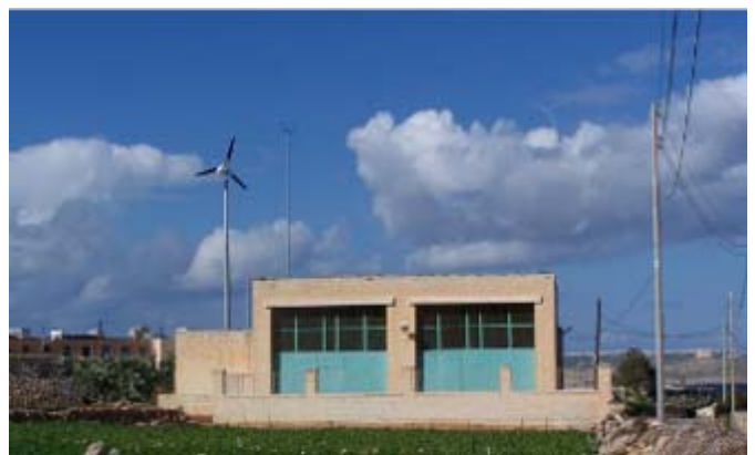
Vendome RES Pilot Wind Turbine