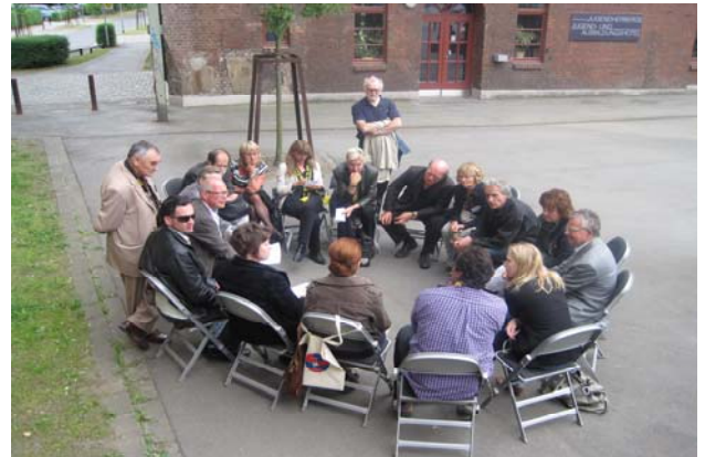
Event: Workshop on Roma integration