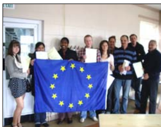
ESOL Program Graduates

The AIMER project, which is run by Medway Council on behalf of the E.U., is designed to help with the integration and greater cohesion of new migrants with the host communities, including ethnic minority residents. On March 23 rd 2011 an awards ceremony was held with the charity METcic to celebrate the fact that 50 new migrants