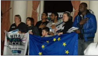
European Participants to the Acces Event.

This year marked the 2 nd Anniversary of project Acces with the annual event being held in Medway on the 5 th & 6 th of February 2011. The event was held at the Corn Exchange in historic Rochester. Residents welcomed 60 participants involved in the ACCES project from France. The two-day annual cross border event was an opportunity for participants to exchange and share through intergenerational activities. The big challenge was to mix up residents and participants from the 3 prime activities of "Engaging, Inclusion & Empowering of Young People", "Parents to