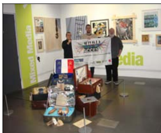
The Winning Group "Suitcase Museum Display"

Artists from across Kent were invited to submit their work inspired by the Chatham historic dockyard so it could be exhibited in the new nationally recognised gallery space