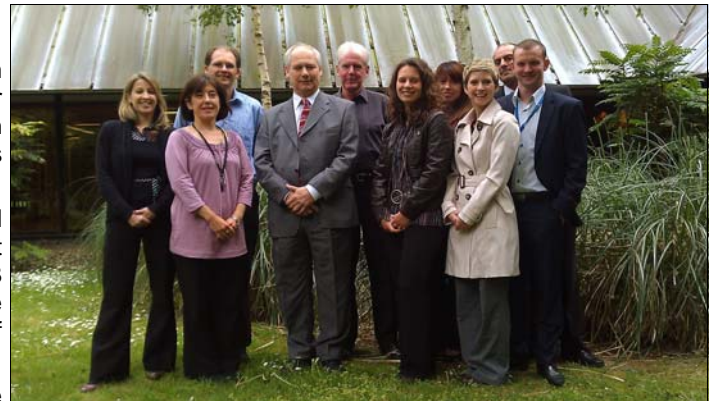
Medway Councils E.U. Project Officers

Based in the Economic Development, Tourism and Social Regeneration service, the projects we deliver focus on a range of priorities, including community development (Acces and Aimer), neighbourhood improvement (Inspire), support to businesses (Ten) and skills training and employment support (Succes).