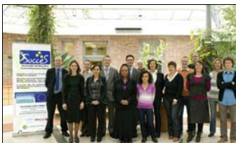
Succes Local and International Partners

The newest member of Medway Council's growing family of EU projects, is SUCCES!