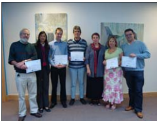
The Advanced Group

Since April 2010, nineteen individuals have been learning French to prepare their businesses for trading in France and the Single European Market