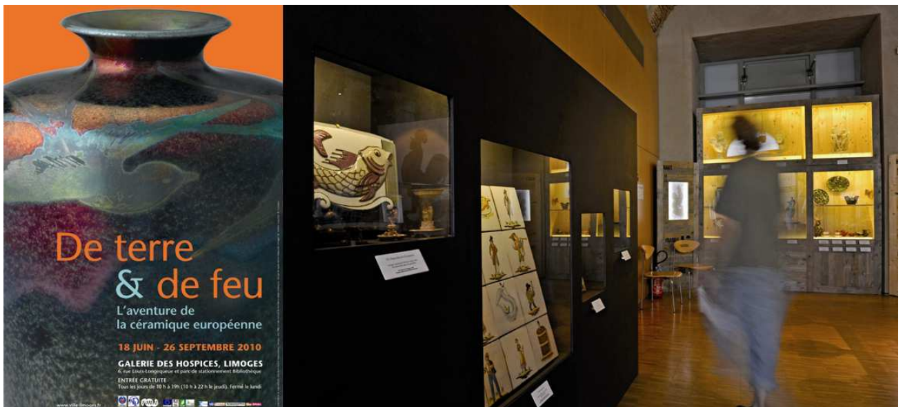
Opening of the exhibition “De terre et de feu”, on 17th July 2010