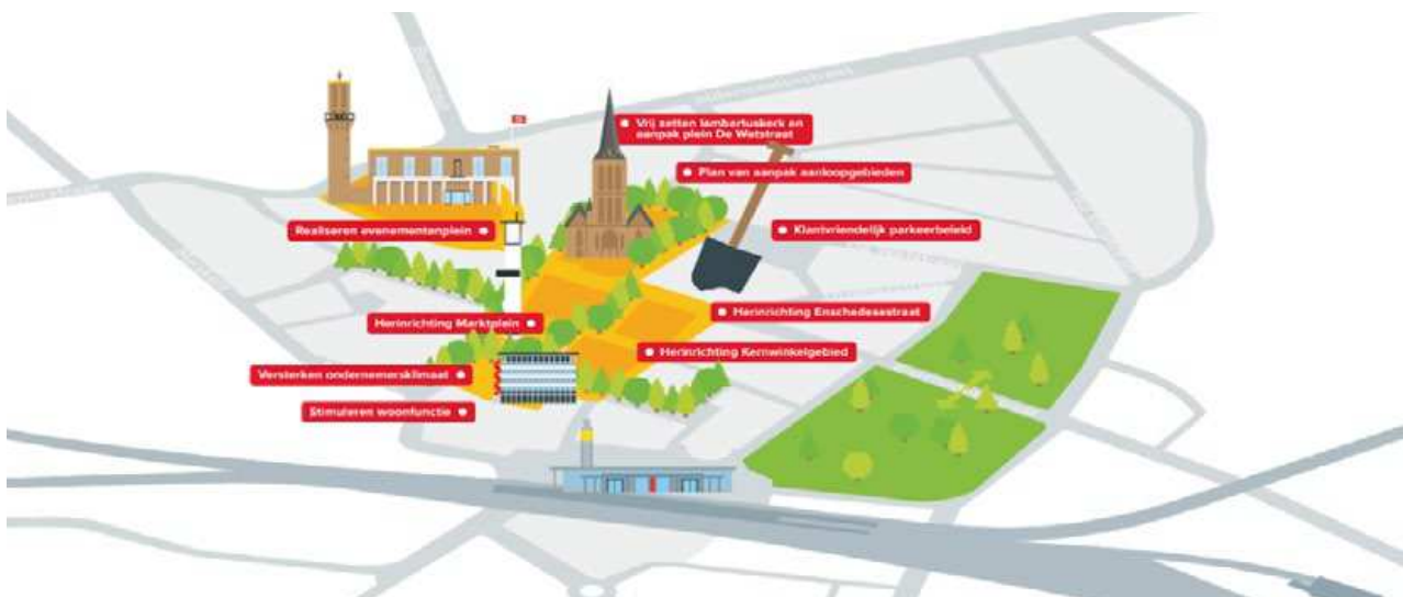
Figure: Overview of actions in the map of the city centre