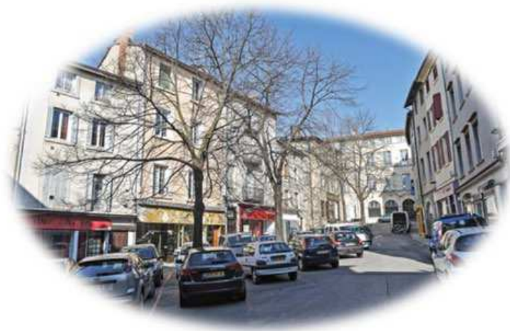
The place Perrot de Verdun before works

Meetings, visits and literature showed us this is a national problem, a problem shared by almost all medium-sized cities, like ours. Joining the RetailLink transnational program also made us aware that the problem of urban vitality decline also exists at the European level.