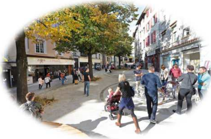
The place Perrot de Verdun after works