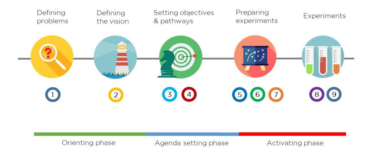
Figure 1: Vejles transition process

During the development phase of Vejle's resilience strategy from 2014 to 2016, we had several stakeholder workshops to identify perceptions in and about the city, as well as the areas to focus on when building resilience. We also developed an actions inventory of all the actions and initiatives in Vejle. We therefore had a very thorough system and context analysis of Vejle and the West End, when entering into this project.