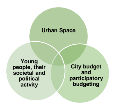
Graph 1.TARTU IAP focus areas

The main aim of Intergrated Action Plan (IAP) of Tartu is to provide guidelines for communication and engagement activities for e-engagement of key stakeholders on 3 priority focus topics presented in graph 1. According to our vision all these 3 focus areas are interrelated and partly overlapping, so addressing one, the other two will be affected as well.