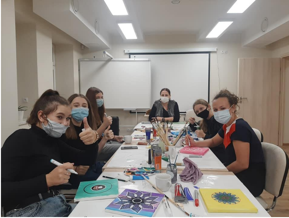
Workshops with youths