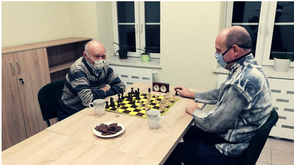
Activities for Elderly