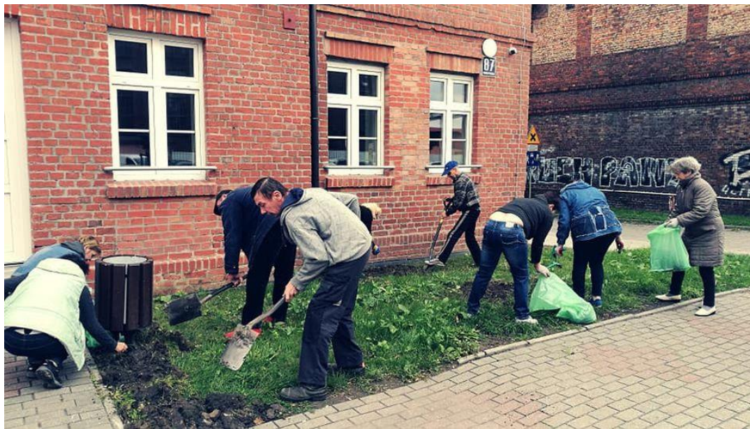
Volunteers help in CSS