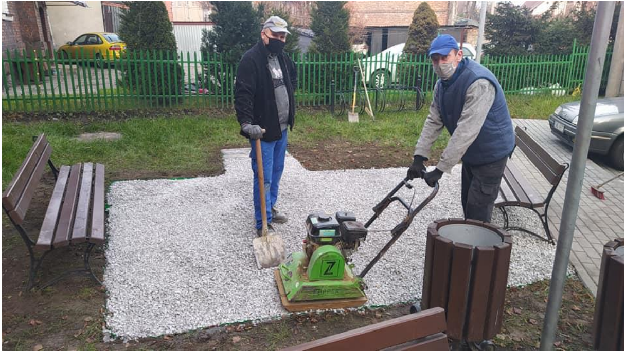
Volunteers helping in CSS