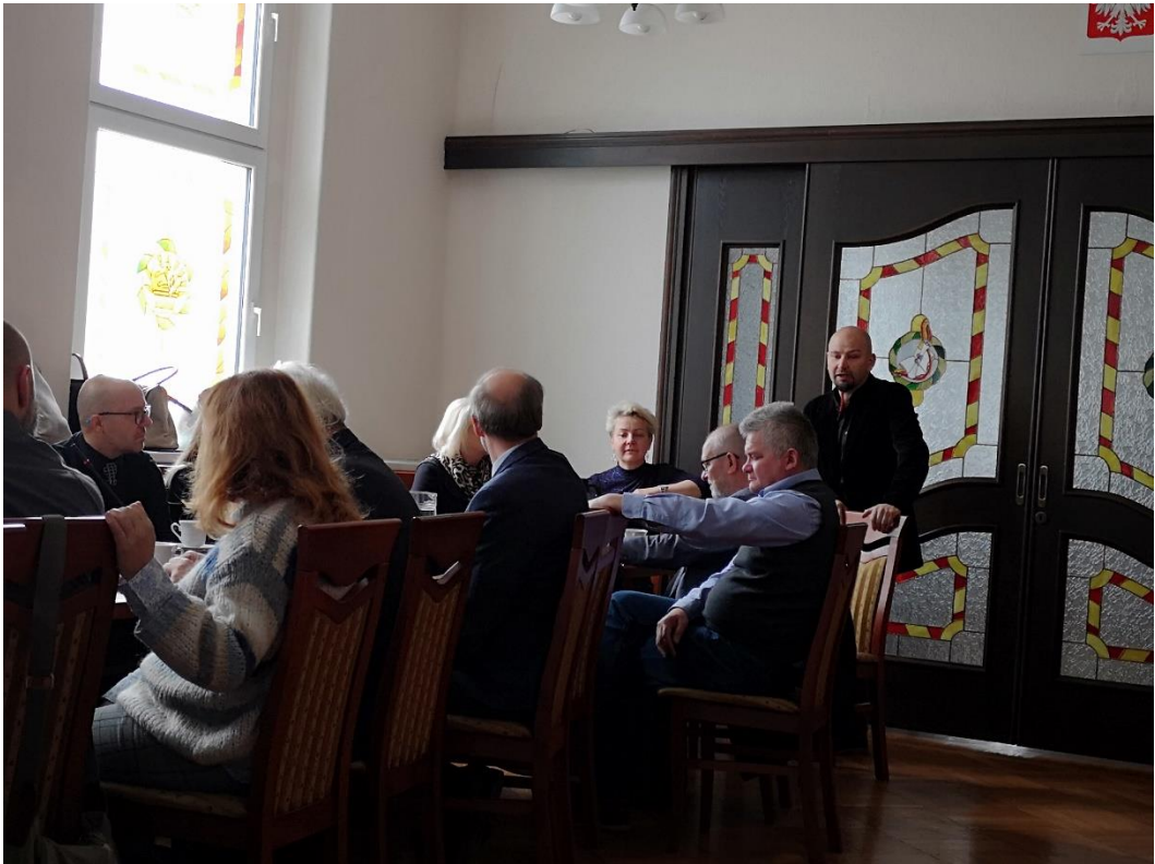
Volunteering Council in Radlin