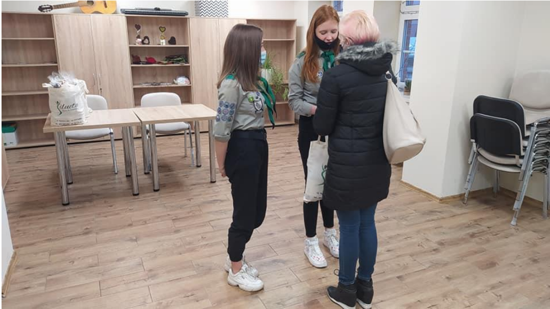
Youths help citizens during action "Invisible hand".