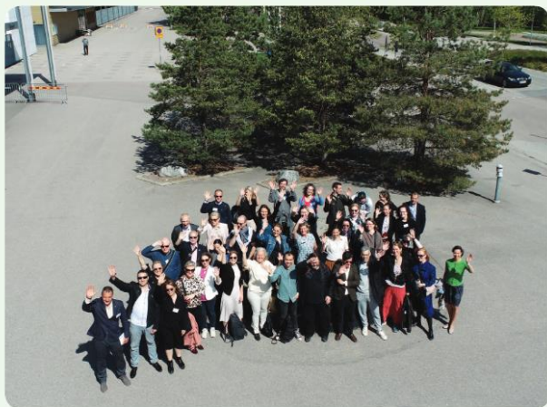
Global Goals for Cities partner city Gävle

Reference Framework for Sustainable Cities - RFSC