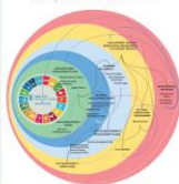
Development documents in Tallinn

SDGs were comprehensively integrated to "Estonia 2035" strategy. As "Tallinn 2035" development strategy was developed in parallel with the national strategy, the city and the state council contributed to both processes.