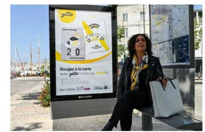
→ Mobility survey from a gender perspective