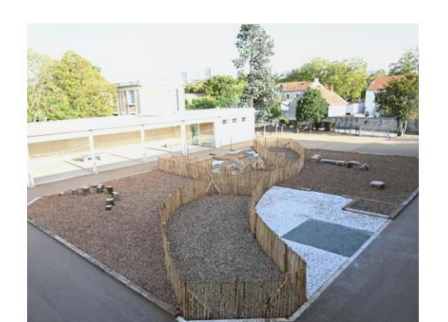
→ Best practice guide for inclusive school grounds