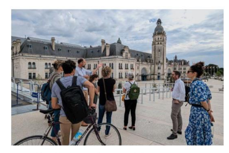
→ Thematic working group on inclusive urbanism