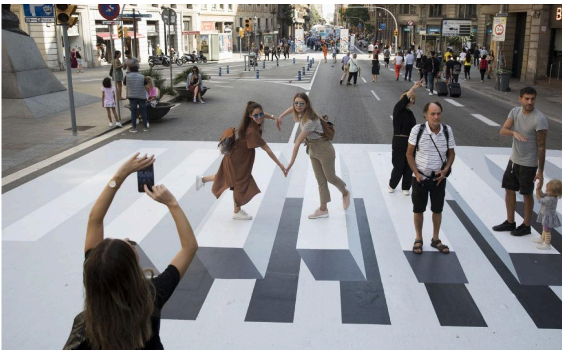
2019 European Mobility Week. Via Laietana, Barcelona.

This issue is particularly crucial for the Beyond the Urban URBACT network, which plans to delve deeper into the topic at the upcoming Transnational Network Meeting (TNM) in Hradec Králové, Czechia, in March 2025.