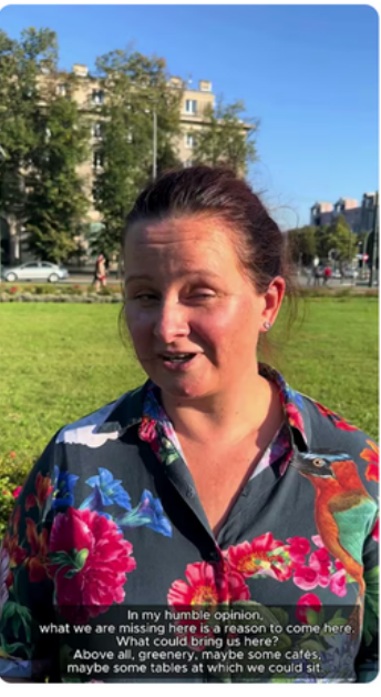
Archethics | Discover Nowa Huta district in ...