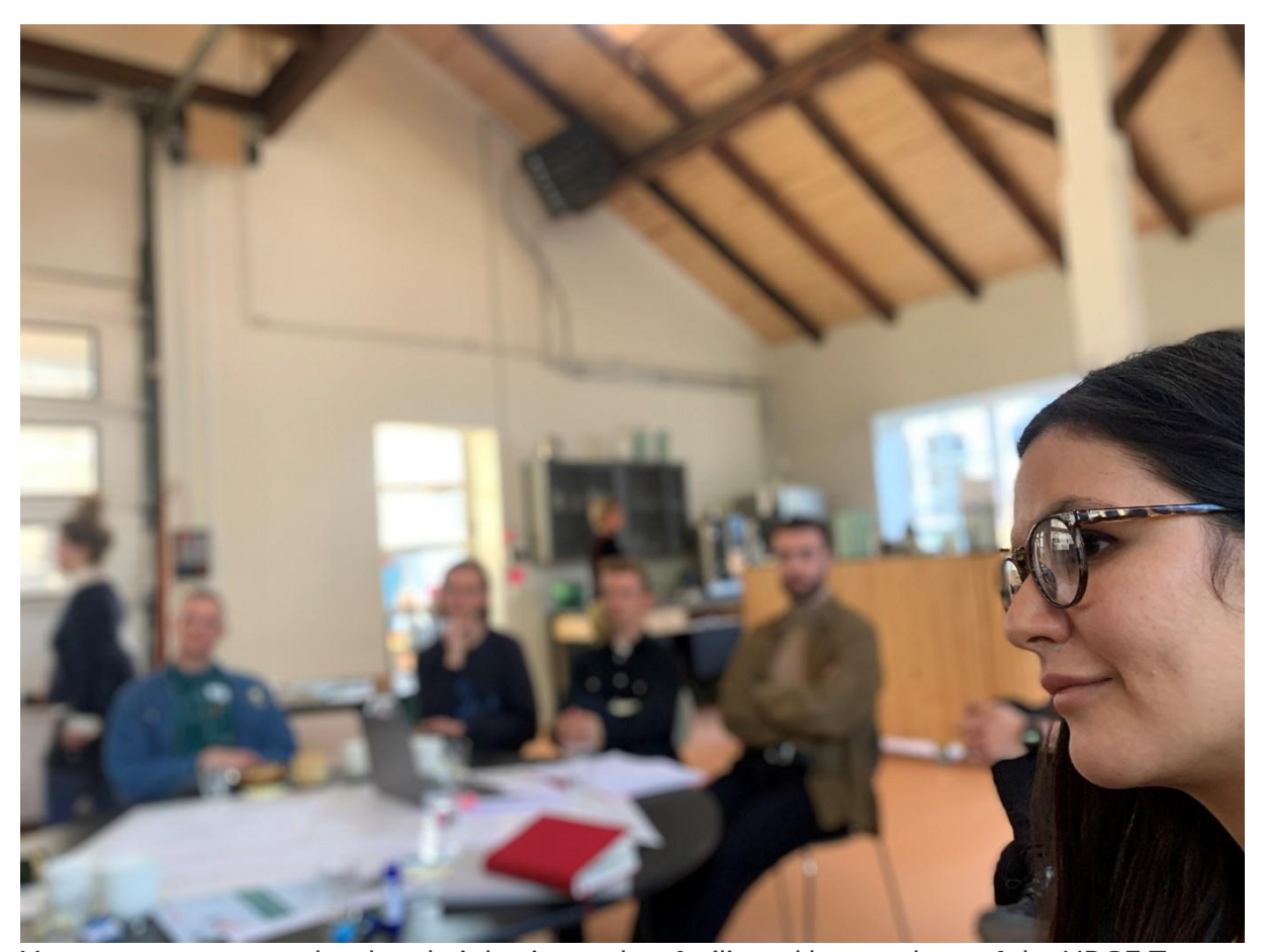
Young entrepreneurs develop their business plan, facilitated by members of the URGE Team

I don't think there is a quick fix or a single tool to tackle the complexity of the challenges. Therefor we are exploring different approaches that can contribute to the solutions. We must engage the different actors, communities and the citizens. With the Encubator , we focus on supporting the development of SMEs that address specific circular possibilities of building and construction materials.