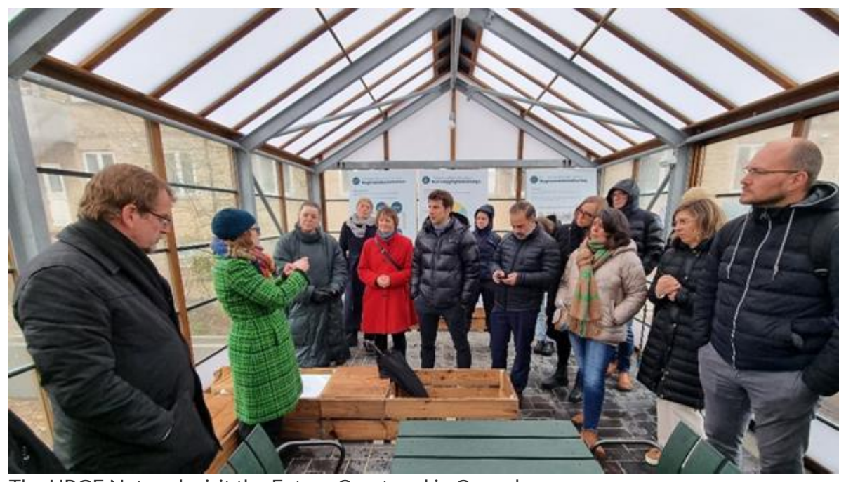
The URGE Network visit the Future Courtyard in Copenhagen

Another issue concerning knowledge also addresses the environmental impact of recycling: In order for used building materials to be reused or recycled, they must be tested for environmentally harmful chemicals. In a Danish context, this is particularly the case for buildings and renovations from 1950-1986 which contain chemicals such as PCB, asbestos, lead based paints etc. which, on the basis of environmental screenings, must be removed before a demolition or renovation (VCØB, 2022). Likewise, reuse and recycling of used components demands information regarding the components' technical properties and durability.