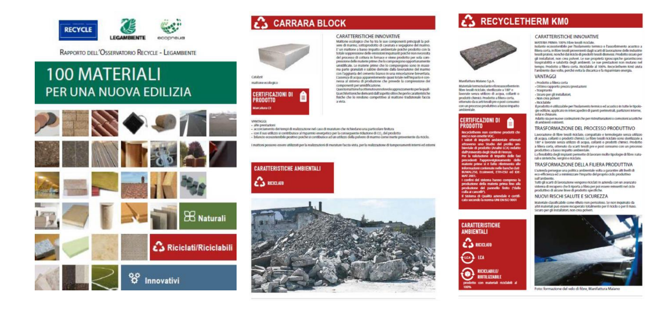
Figure 1: A few examples from the report on 100 best practices

This is the activity of Legambiente: it investigates processes, numbers, and tries to communicate providing new perspectives and visions.