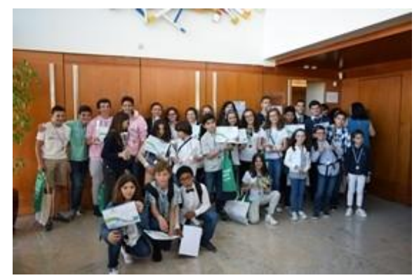
During 2019, OesteCIM developed an awareness campaign at major events of the twelve municipalities of the West Region. The use of human eco-points conveyed the message of waste packaging and illustrated the importance of its recycling and the responsibility of citizens in the selective disposal of waste.