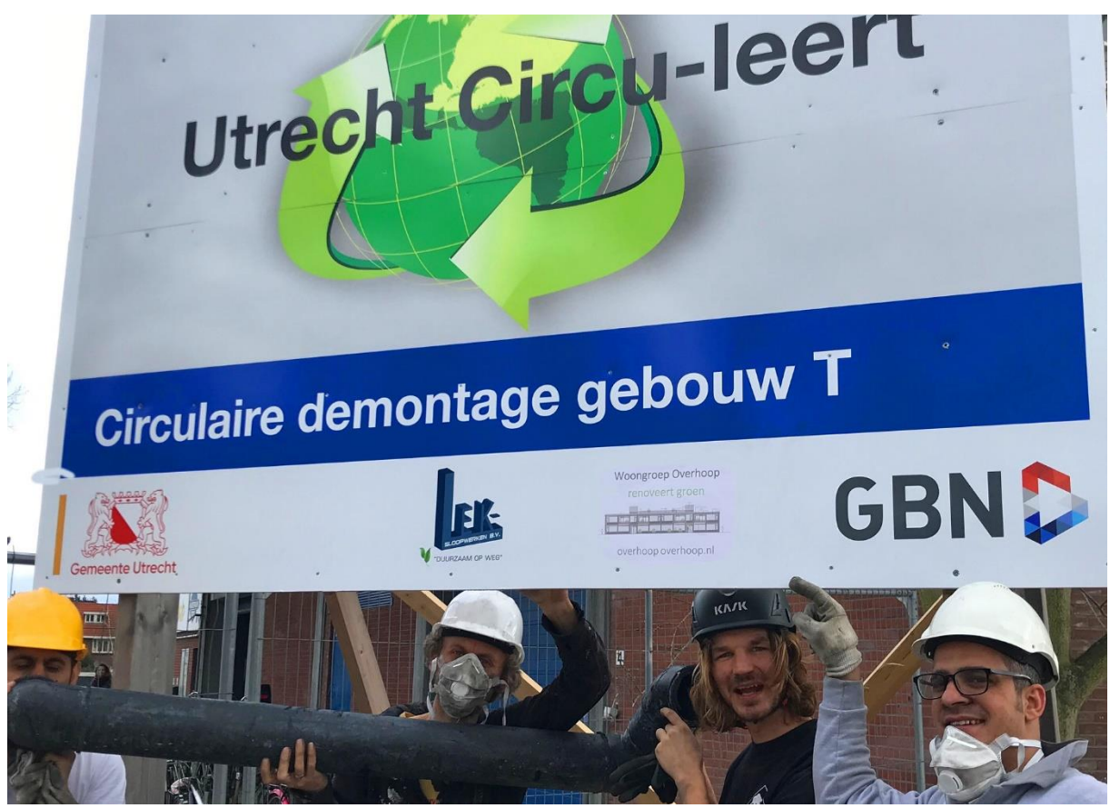
Circular demolition of the RotoSmeets & T buildings at Merwedekanaalzone, Utrecht

We see that in the city we are moving from pioneering to upscaling: steps for this next phase are being made and we are getting more professional in the operations. The city is activating a group of stakeholders so to take these next steps together. At GBN, we support this process.