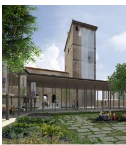
Figure 5 – Virtual representation of the rehabilitation of 'Palais de Via'