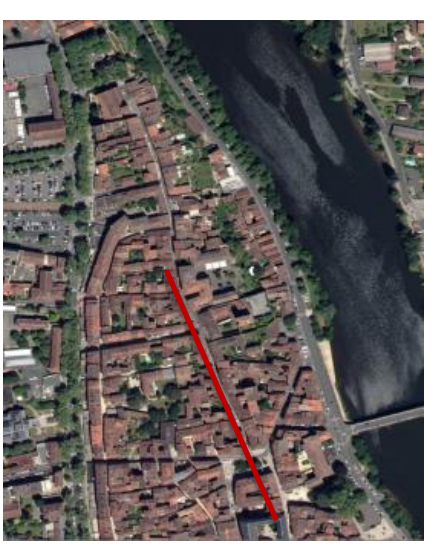
Figure 2 – The Château-du-Roi

What you found more distinctive on this street?