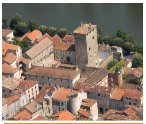
Figure 4 – Cahors' former jail -'Palais de Via '