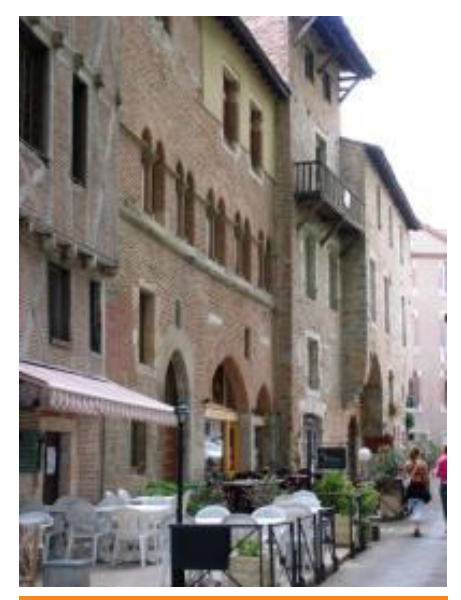
Figure 6 – Another Cahors historical street.

The third workgroup focused on the promotion of the city, taking advantage of the public and private spaces and building that have been rehabilitated until now. The "new face" of the city together with a revitalization of the old centre is changing the city life and has increased its attractiveness to visitors and investors. This requires the development of a new strategy for the promotion of the city that highlights the changes operated in the old city centre. A lively and safe urban environment will definitely attract more residents, shops and other services into the old town, turning it into an attractive spot for visitors. Therefore it is important to gather views from peers as they provide the necessary external view of the city that will be impossible to get by just working with residents and authorities. The workgroup focused therefore in the following key aspects: