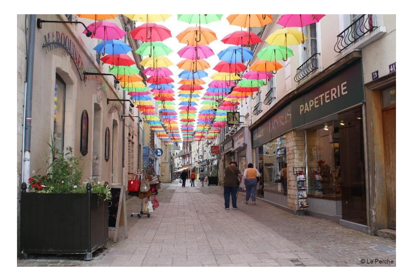
Figure 9 – An example of the possible final layout of Château-du-Roi Street after revitalization. In this photo 'la rue d'Huisne' in the commune La Ferté-Bernard en 2017 (Pays de la Loire, France).