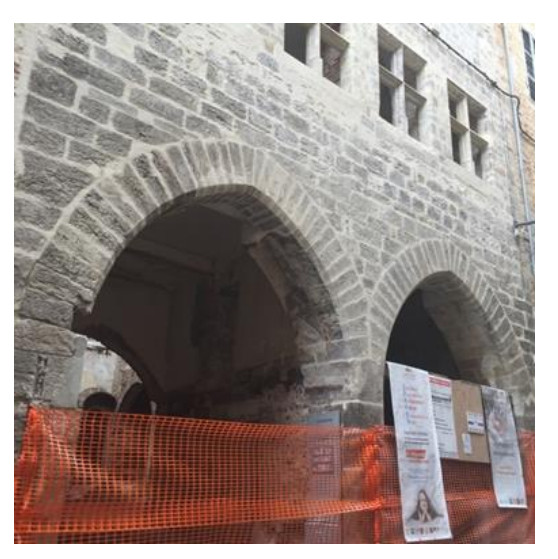
Figure 8 – The building on 72 before and now. The opening of the courtyards under the arcades creates new opportunities for revitalization of the street