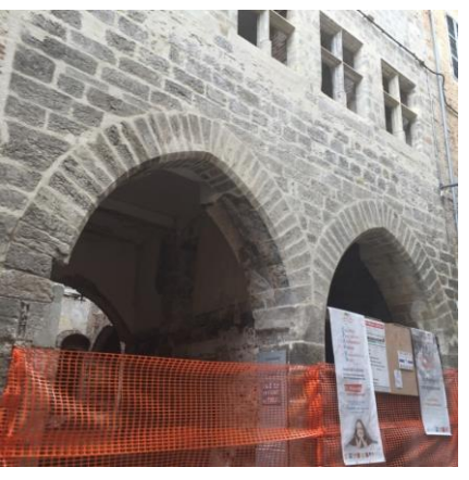
Figure 3 – The Building 72 Château-du-Roi Street