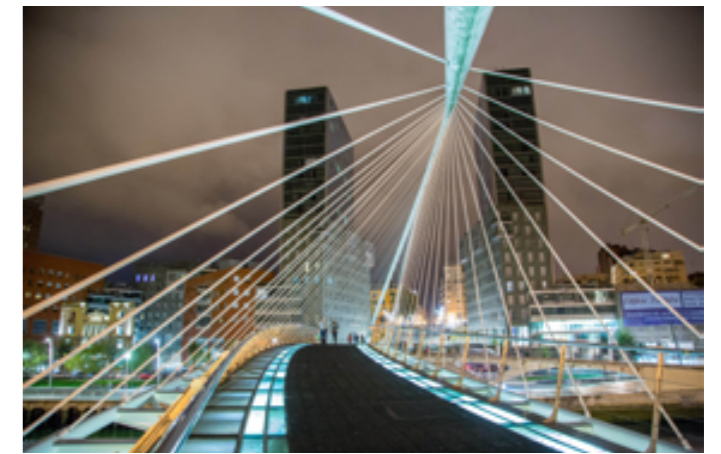
Bilbao's Zubizuri bridge

Together these stakeholders have co-designed a long-term operational work plan, the Integrated Action Plan. In this plan, Bilbao Ekintza becomes a facilitator of the specialisation process. This means facilitating the identification of new